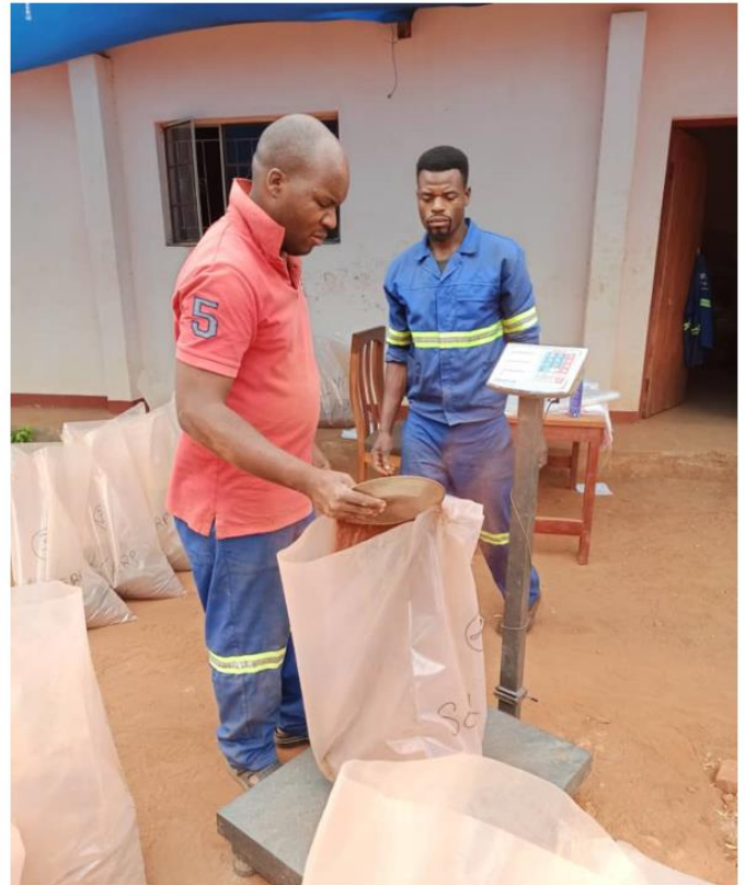
Figure 5: Bulk sample preparations in Malawi prior to despatch to Australia.