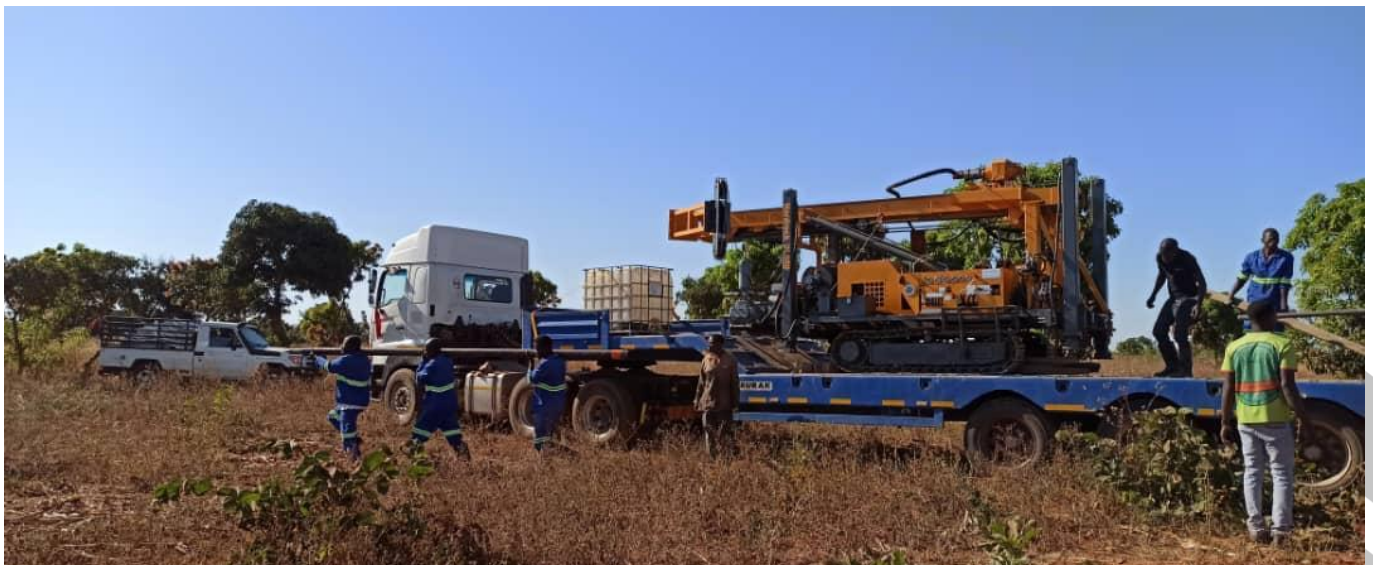
Figure 6: Core rig mobilising at Kasiya

Baseline environmental studies have commenced covering terrestrial flora and fauna, aquatic biology, air quality, surface water and groundwater studies. The Company has continued engagement with all stakeholders from local communities through to the Government of Malawi.