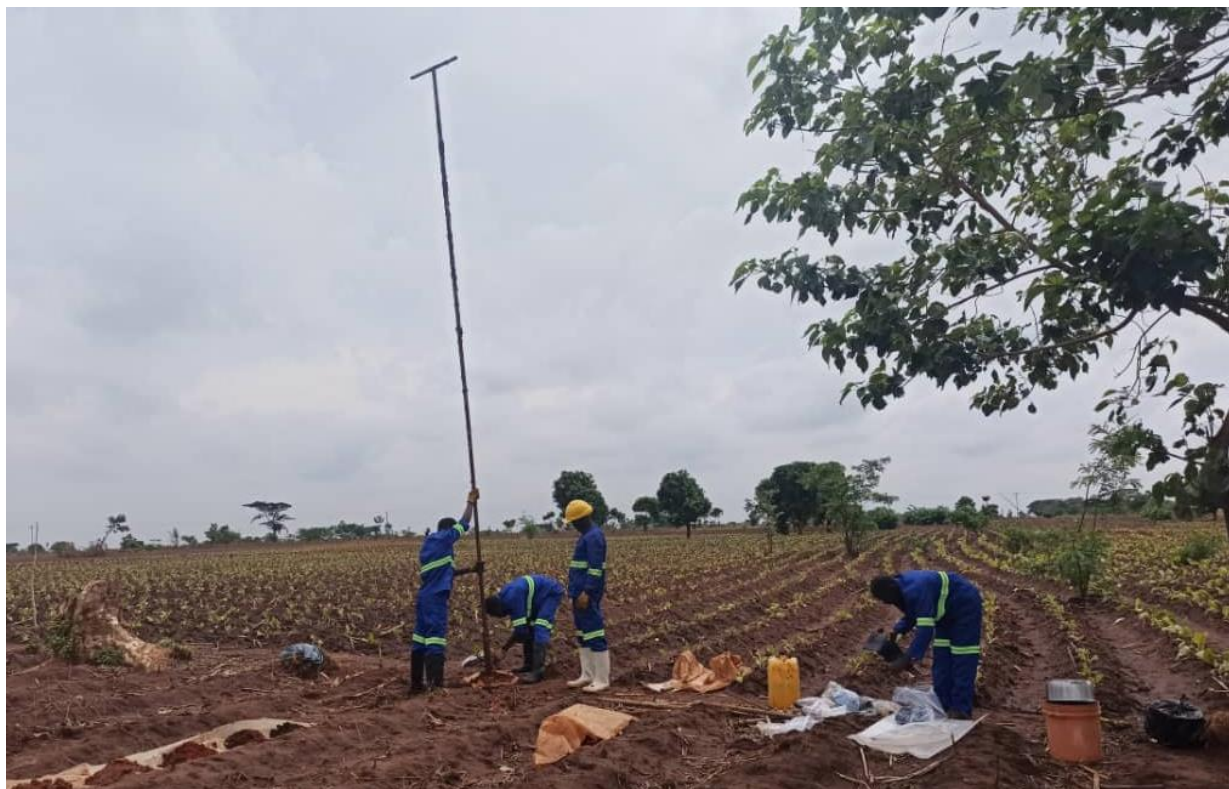
Figure 3. Sovereign's field team hand-auger drilling at Nsaru.