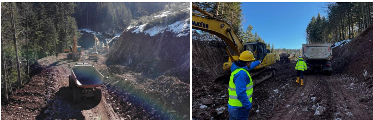
Figure 1: Site clearing and construction of the access road to the lower and upper portals at Rupice

Access road construction at the Rupice Surface Infrastructure site commenced in November 2021 and is progressing well. To date, access road sites have been cleared and a road constructed from the northern access road to Rupice (from Kakanj) to the site of the upper and lower portal pads.