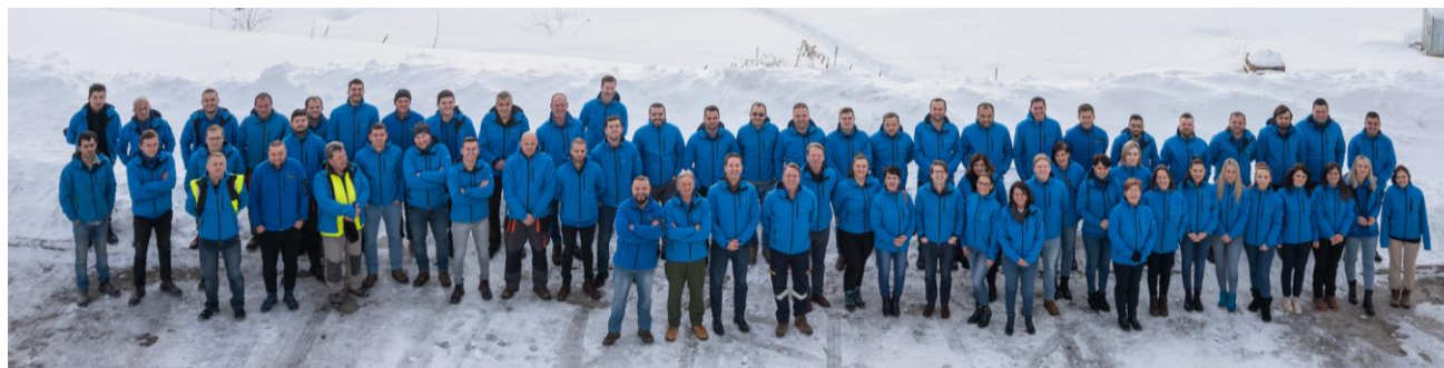
Figure 2: Group photo in Vares, December 2021