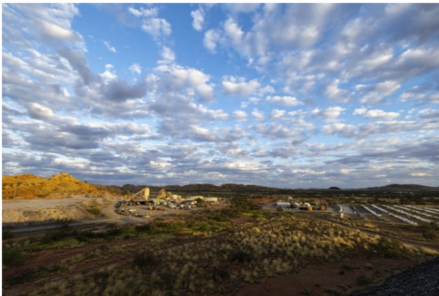
Figure 1: Paulsens Gold Operation – significant infrastructure; ready for restart.

At Black Cat, the past year has largely been about the Restart of Paulsens. Our strategy going forward is to use internal cashflows from Paulsens to fund developments at Coyote and Kal East. Our robust studies at Coyote and Kal East emphasise the size of the prize. This strategy requires minimal shareholder funding to build our vision of being a 150,000oz pa producer 2 . At even a modest enterprise value per production ounce, Black Cat has the potential to substantially re-rate.