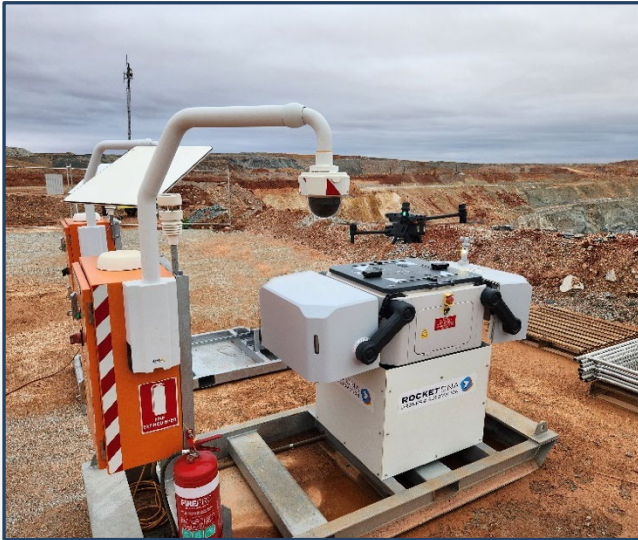
xBot® in operation at Red5, King of the Hills Mine