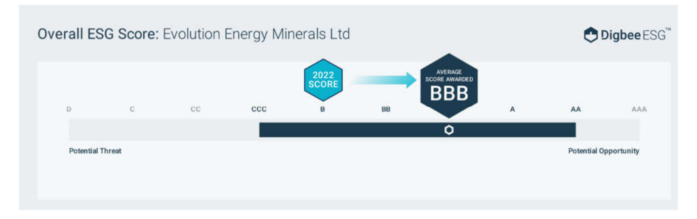
Figure 2. Corporate ESG Rating