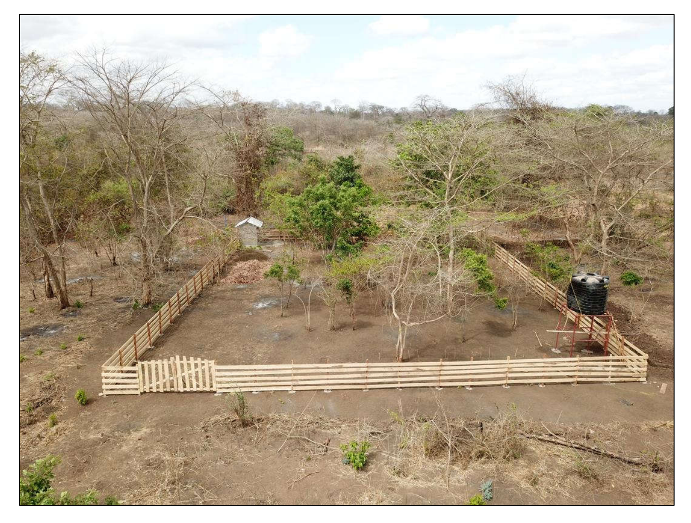
Figure 4. Tree nursery

The nursery will employee people from the local village who will become trained nurserymen/women and then be responsible for sharing this knowledge with an allocated set of farmers.