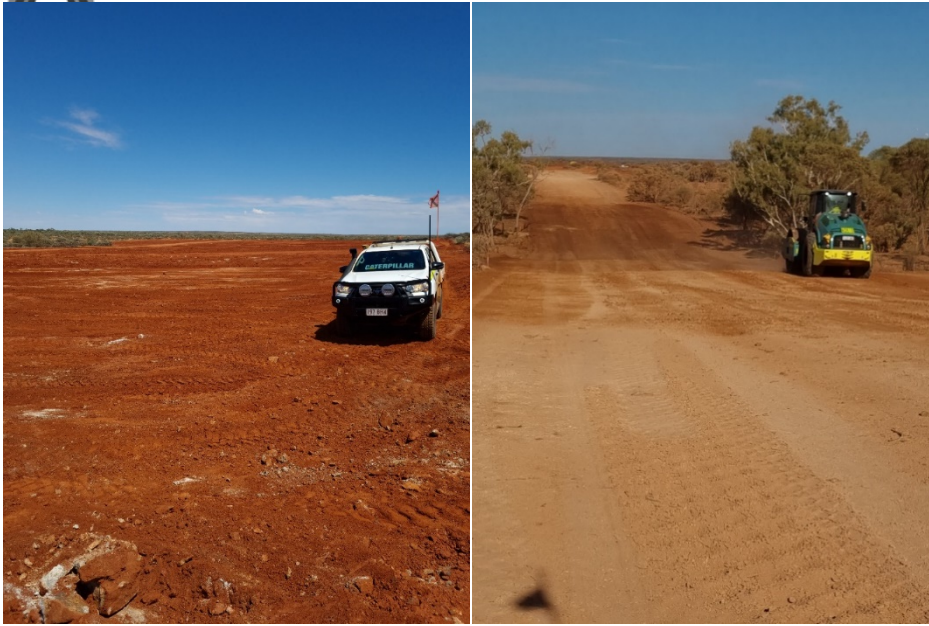
Figure 1 – (Left side) clearing completed for permanent village camp and (Right side) clearing and grubbing of main access road.

This announcement has been approved by the Board for release to the ASX.