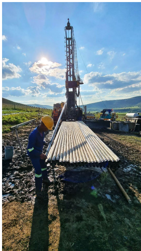
Figure 1 and 2: Core hole 270-03C being drilled