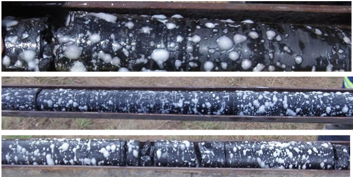
Figure 3: Core samples from 270-03C showing gas discharge at surface

The 270-03C exploration core hole, in some of the Company's southern-most geology and approximately 20 kms from recent successful core well 270-06C ( Figure 4 ), has been drilled and cored to a depth of 605m, with a thick dolerite sill from 128m to 290m, and gassy sandstones, coal and carbonaceous siltstones and mudstones below. Gas shows were nearly continuous below the dolerite during the drilling. Gas desorption analysis is being completed on the core samples of the coal intervals ( Figure 3 ) and wireline logs are currently being processed.