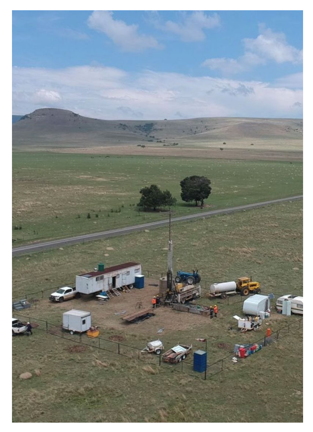
Figure 2 - Core well 270-06C being drilled in the southern most region of the Company's granted rights

The Karoo sequences are known to dip southwards in this region and we therefore expect to encounter deeper terminal depths in our southernmost boreholes, with concurrently higher pressures and gas flow rates versus our discoveries to the north. This core hole (which will be followed by others in the next few months) is being drilled to both test this theory as well as provide a new facet to our eventual production plans.