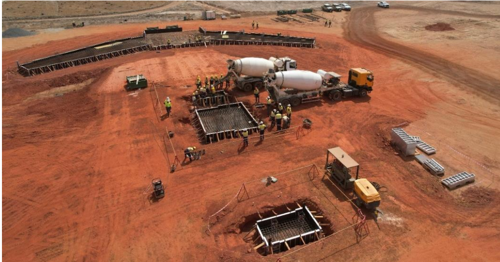
First concrete pour at Goulamina