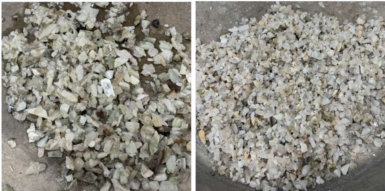
Figure 1. Colina composite 1 indicating 6.3mm (+1mm) sink (left) and float (right) results produced from DMS test work on the Colina ore samples.

Additionally, while simpler and more cost effective to produce, a coarse DMS product is more favourable for conversion into Lithium Chemicals (Lithium Hydroxide) due to its reduced fines content and as such will be attractive to end users.