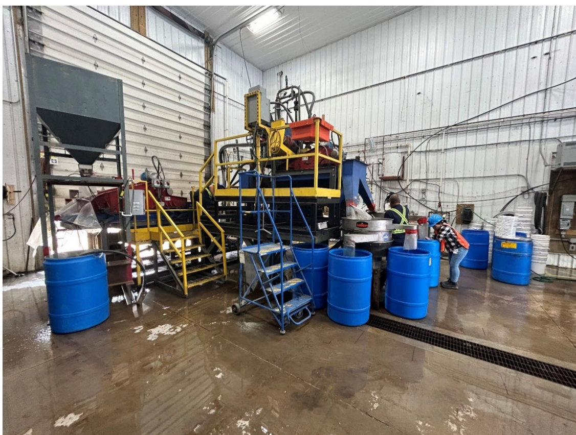
Figure 2. Dense Media Separation (DMS) Pilot Plant located at SGS' Lakefield, used for the Colina DMS testwork.

The equipment utilised for the bulk test program comprised a conventional DMS circuit including a 200mm diameter Multotec separation cyclone, as shown in Figure 2 below. In comparison, it is proposed that the full-scale production facility includes 420mm separation cyclones. The relative performance of the 200mm and 420mm cyclones are well understood and as such, the separation efficiency from this test can be directly compared to the full-scale production facility.