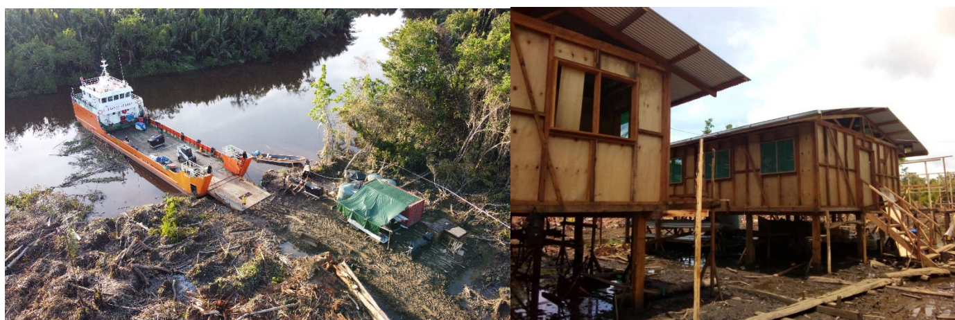
Barge unloading to commence pioneering earthworks and Camp construction underway utilising local carpenters and locally milled timber.

Local landowners, clan leaders, and villagers welcomed the arrival of the barge, and along with labour from the local villages worked under Mayur's supervision to complete the first phase of works and construction camp. The construction, commissioning and operation of the small-scale bulk sampling pilot plant represents Stage 1 of our joint venture with China Titanium Resources Holdings (CTRH) 1 , whereby Mayur and CTRH have agreed to fund the capital costs of the pilot plant phase on a 50/50 split. However, Mayur under this funding agreement have exercised its rights to defer 50% of its funding obligations to Stage 2 (Full Scale Plant). Under the funding agreement with CTRH, CTRH are required to fund 100% of Stage 2 capital by investing up to USD $25 M for an earn in to Mayur Iron of 49%, with Mayur Iron being the 100% owner of the Orokolo Bay project.