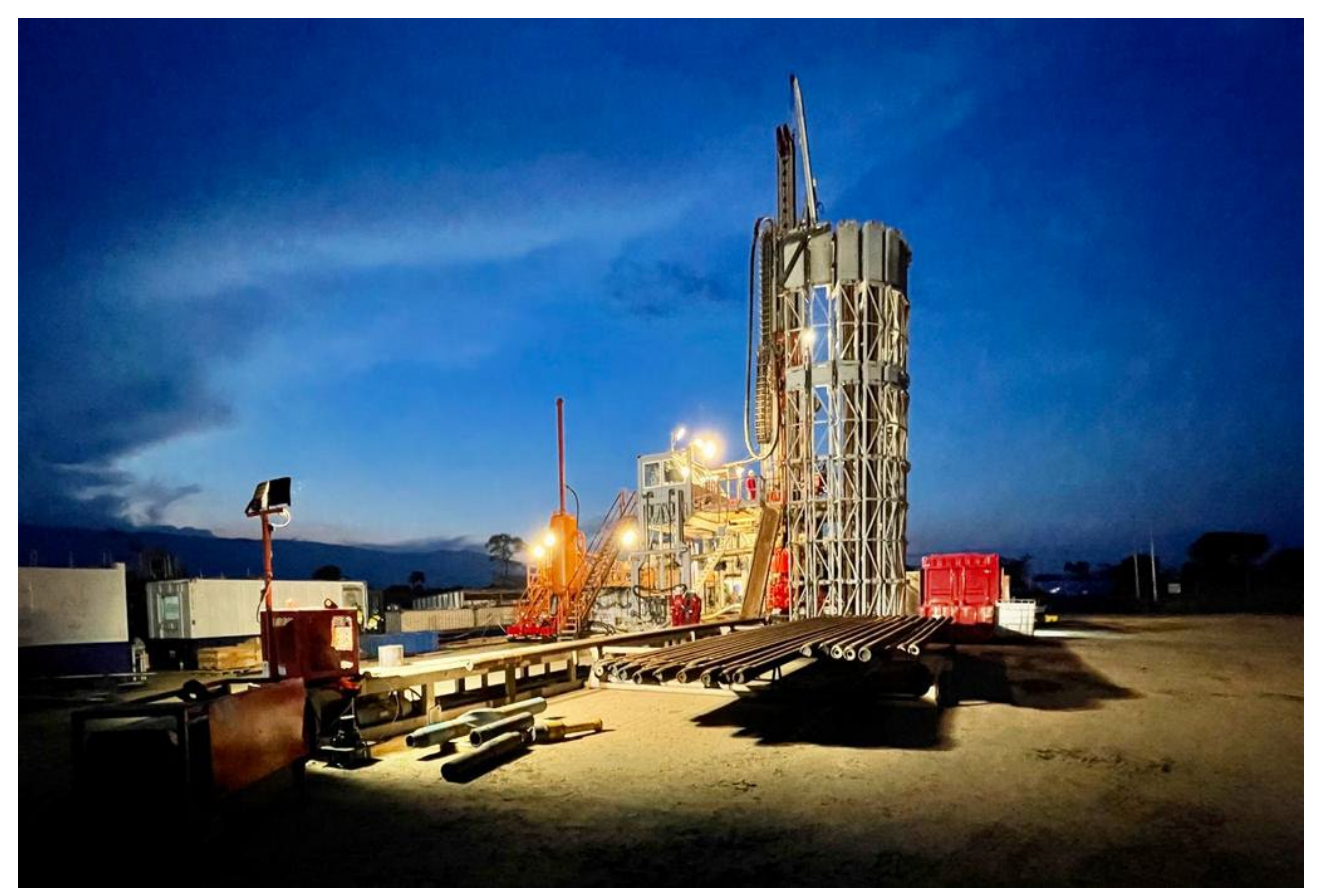
Marriott Rig #16 fully rigged up, ready to commence drilling

With this milestone, the well control certificate of insurance can now be issued, allowing the Company to direct Marriott to commence drilling.