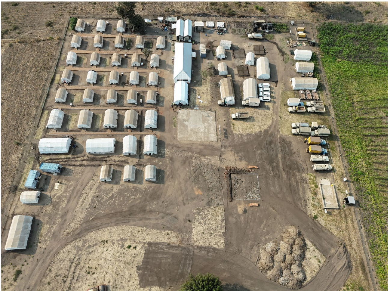
Figure 3. A 100-person drilling camp is on track for completion this week at the North Rukwa Project.

The camp, located 15km south of the Mbelele wells, will be used as the base for the Company's upcoming drilling activities at North Rukwa, which is around 80km by road from the regional township of Sumbawanga.