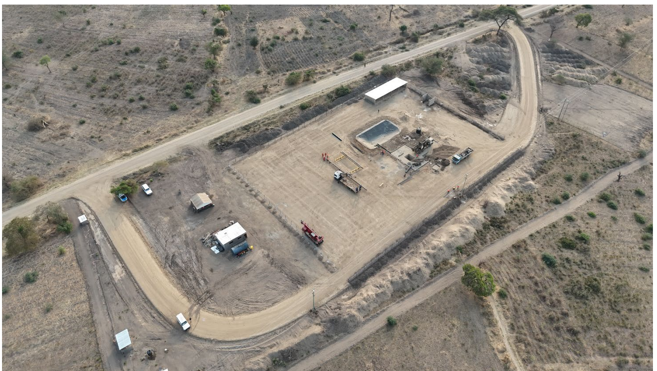
Figure 1. Mbelele-1 well site complete and ready for drilling to start in late September.

Two well pads have been under construction at the Mbelele-1 and Mbelele-2 well site locations for the last 6-8 weeks, in preparation for the arrival of the rig and the start of the Company’s maiden drilling campaign. Mbelele-1 site is now 100% complete and ready to receive the rig, while the Mbelele-2 site is on schedule for completion by the end of the month.