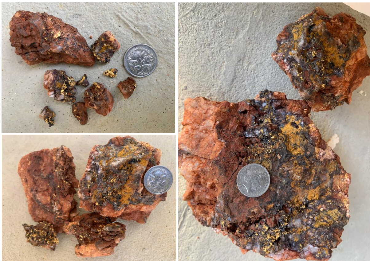
Figure 2: Rock specimens with visible gold.

Of particular note, reconnaissance stream sediment sampling identified significant gold colours in pan concentrate (maximum 62 pieces) over a 750 metre strike length. Additionally, metal detecting identified a quartz-ironstone rock with abundant coarse (up to 4mm) and fine gold at one location (Figure 2).