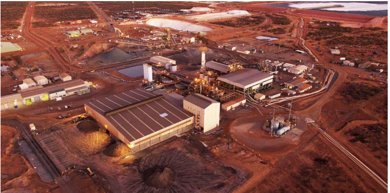
Figure 1: Processing plant at Golden Grove Mine, WA

As per the field trials with DIT, the trial at Golden Grove will compare the performance of an ecosparc ® enhanced coating with a control area coated with a market leading anti-corrosive paint. Sparc's key obligations, as outlined in the Trial Agreement, are to supply the agreed quantities of ecosparc ® enhanced and unmodified control coatings to Golden Grove at Sparc's cost, along with specified application instructions. 29Metals' obligations include to provide and prepare the agreed steel infrastructure and to arrange for application of the ecosparc ® enhanced and control coatings at its own cost. A summary of the material terms of the Trial Agreement is set out in an Appendix to this announcement. The financial impact of the Trial Agreement is negligible. However, the Trial Agreement is material to Sparc on the basis it represents a further key milestone in the testing of the Company's flagship graphene based additive product on key infrastructure in relevant real-world environments.