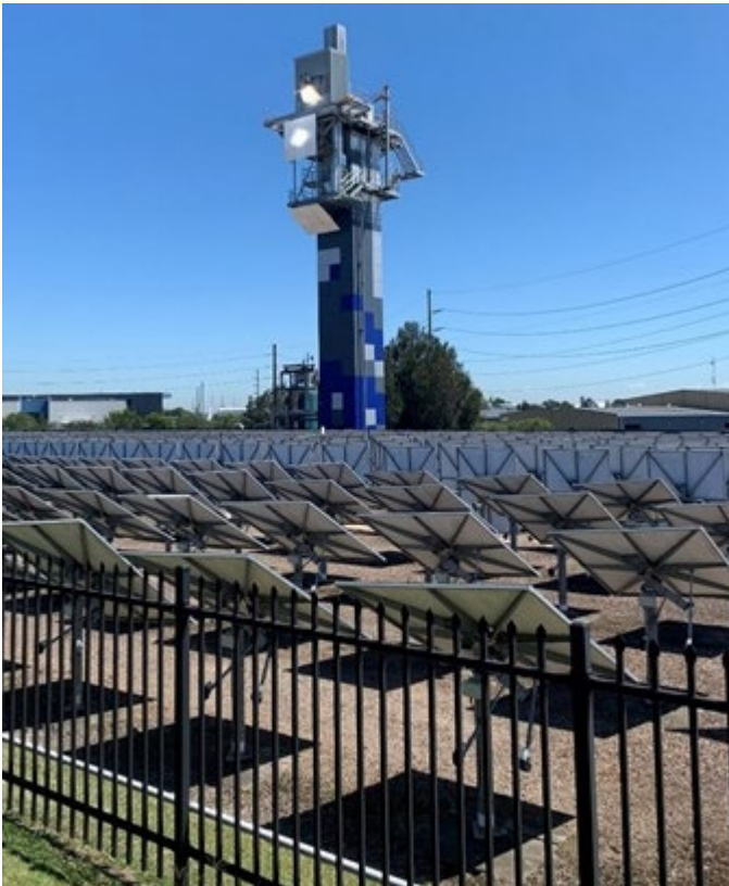
Figure 1: CSIRO Energy Centre solar concentrator facility