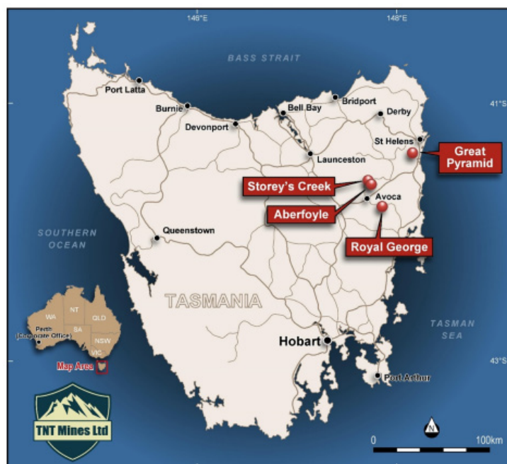
Figure 1. Location of TNT Mines' tin-tungsten projects in north east Tasmania

TNT Mines Ltd (ASX: TIN) ("TNT Mines" or "Company") has announced the successful completion of the first diamond drill hole at its highly-prospective Great Pyramid tin project in north-east Tasmania (Figure 1) (refer to ASX announcement dated 26 th June 2018 for further information).