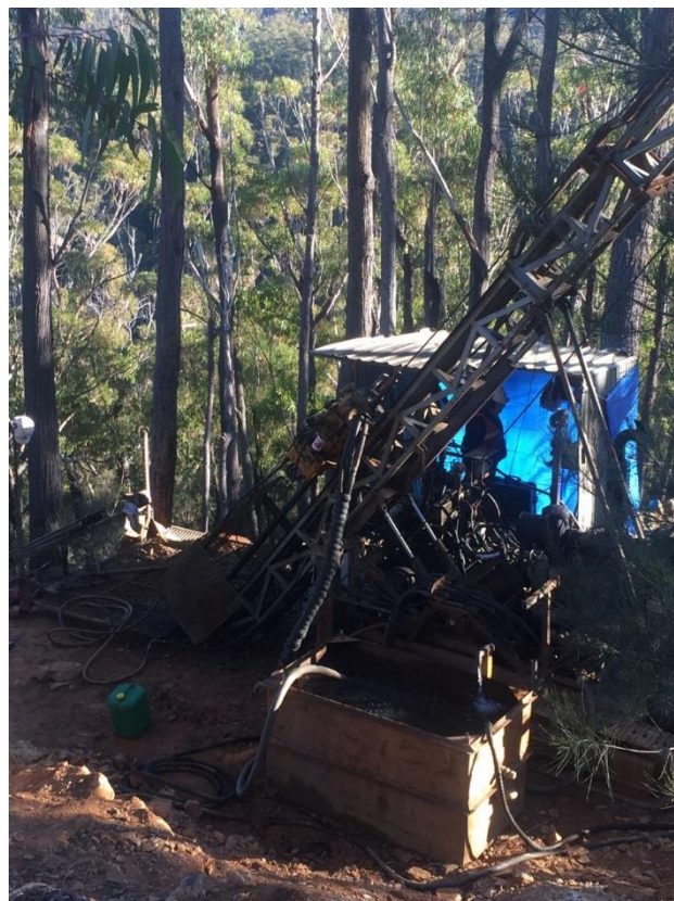
Photo – diamond drill rig on site at Great Pyramid