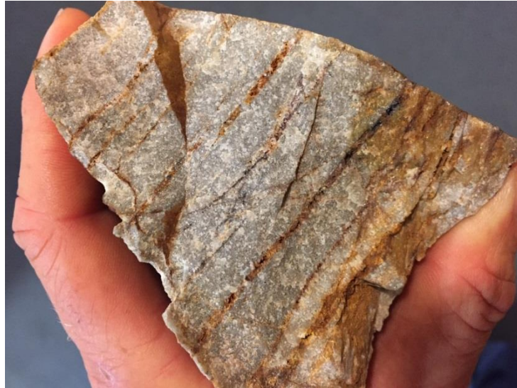
Photo – hand specimen of typical Great Pyramid tin-bearing quartz veinlets in silicified sandstone

Drilling is expected to take approximately 10 days to complete, and will be followed by logging and core processing.