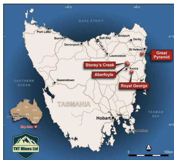
Figure 1. Location of TNT Mines’ tin-tungsten projects in north east Tasmania

Since its IPO in November 2017, field work has generated quality drill targets at the Great Pyramid tin deposit, where the Company sees strong potential for locating additional tin veining within a significant body of silicification and alteration.