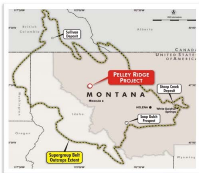
Figure 1: Location of the Pelley Ridge project and outline of Basin Supergroup

Within the Bromley lease lies a conspicuous gossan outcrop, called Gossan Knob, which covers some 30m x 150m in diameter with exposure to the north obscured by shallow transported gravels. Cominco drilled 8 holes at Gossan Knob with PR-02 returning high-grade intercepts of including 14.9m @ 5.43% Zn from 71.3m (including 10.8m @ 7.21% Zn), below a wider zone of 25.3m @ 3.26% Zn from 24.4m. Nearby and subsequent drill holes supported the presence of a strong zinc-rich alteration event, with widespread >0.25% Zn anomalism and mineralised intercepts to 25m @ 3.09% Zn from 25m in PPR-95-09, 16.77m @ 3.11% Zn from 56.5m in PR-01, and 29m @ 2.70% Zn from 41.1m in PR-04.