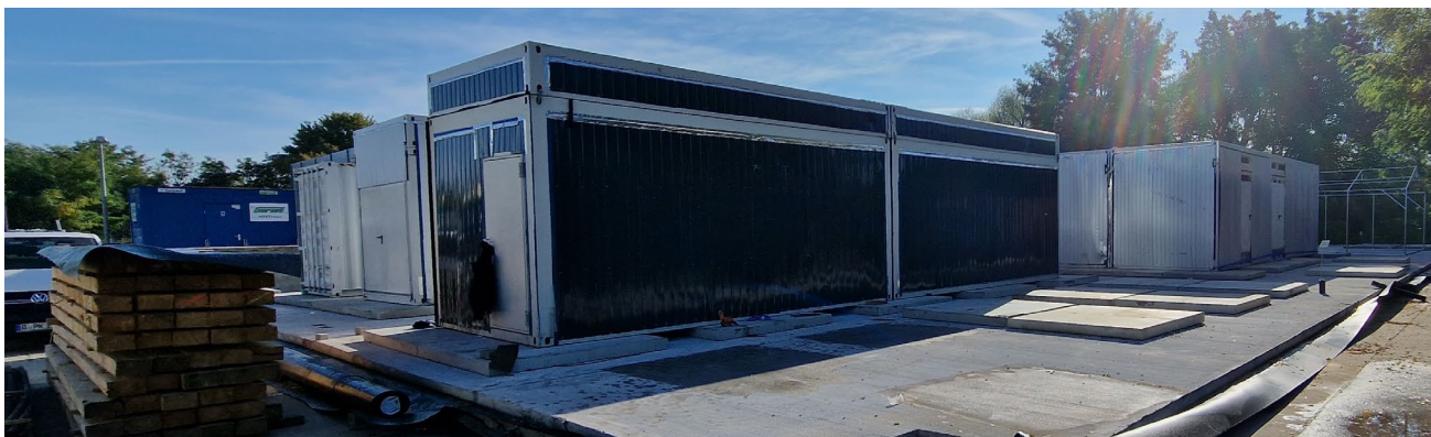
Figure 2: Onsite works for Vulcan's Lithium Extraction Demo Plant.

Vulcan received approval from the state authority in Rhineland-Pfalz, Germany, for the Operating Plan for Vulcan's lithium extraction Demonstration Plant (Demo Plant). On-site works are ongoing, and once operational, expected by mid-year, it is intended that the Demo Plant will train Vulcan's team in a pre-commercial setting and improve operational readiness prior to commercial plant construction and operation, with initial Phase One commercial production targeted for end 2025.