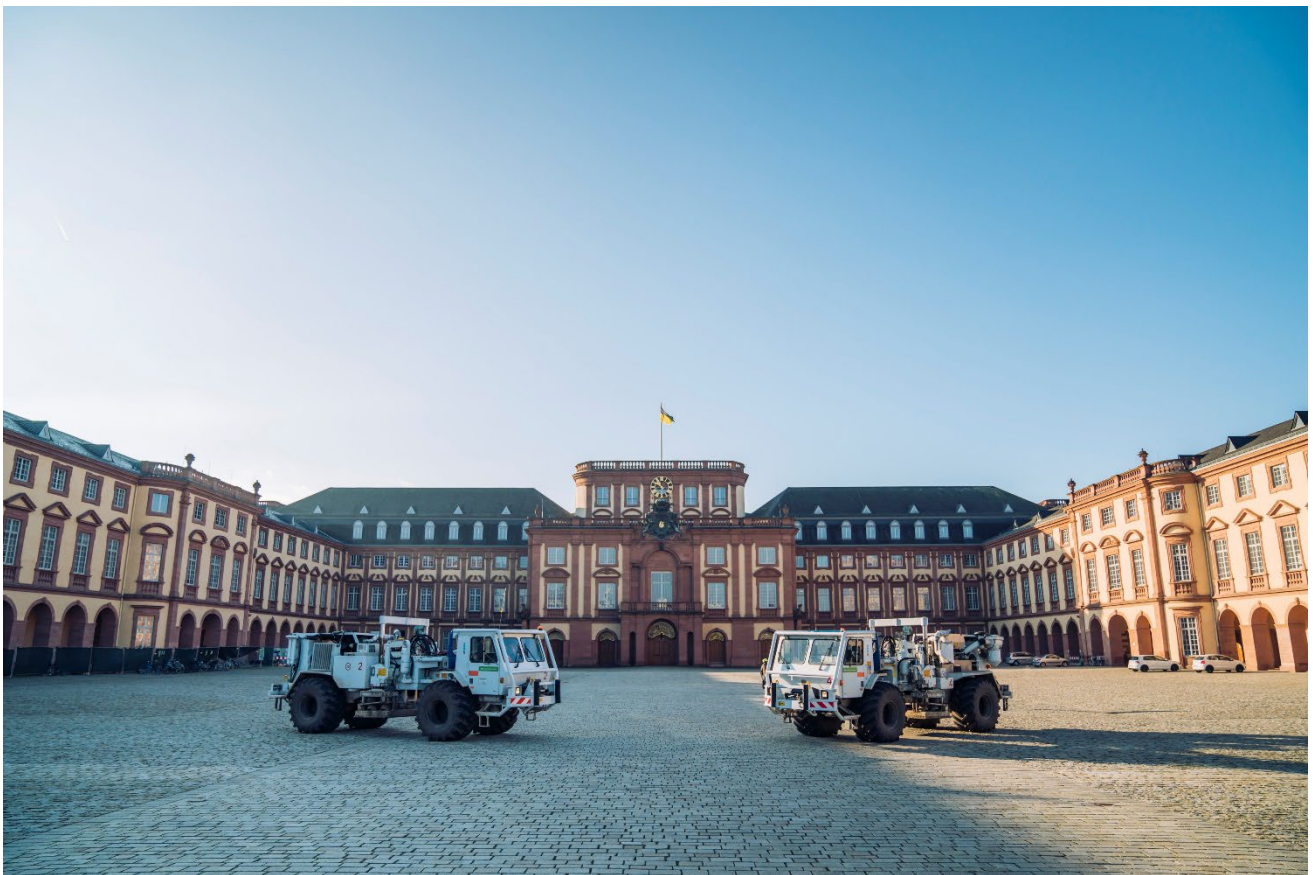
Figure 5: 3D seismic trucks

3D seismic survey works commenced on the ground in one of Vulcan's planned Phase 2 lithium and geothermal energy development areas, in the Mannheim district of the Upper Rhine Valley Brine Field. These works followed prior approval of the main operating plan by the state directorate. The results will be used in feasibility studies for Phase 2, which plans to incorporate the Mannheim area. Vulcan has a renewable heat offtake agreement with MVV, the municipal energy supplier for the City of Mannheim.