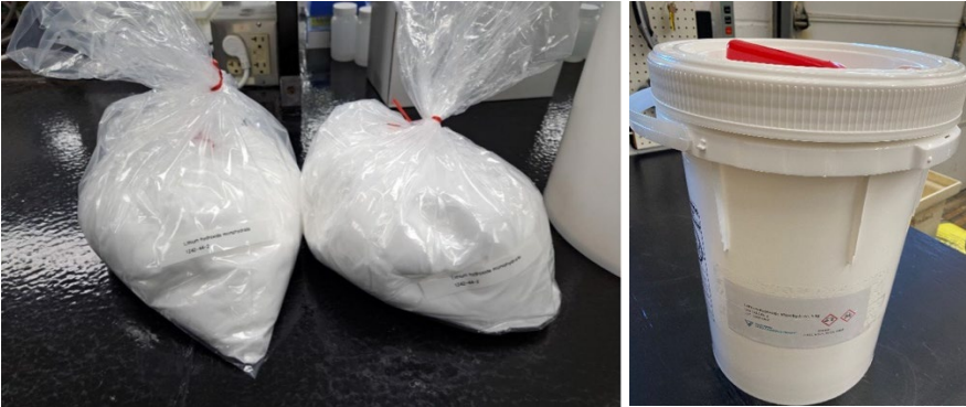
Figure 3: Vulcan’s highest grade, lowest impurity lithium hydroxide (LiOH) to date from its Pilot Plant.

The embodied renewable heat within Vulcan’s brine should enable Vulcan to use the commercially proven sorption method of lithium extraction at relatively low cost, which produces a very high purity LiCl product, which in turn enables the use of Li electrolysis to directly produce very high grade, low impurity LiOH. Vulcan’s Pilot Plant has been successfully operating since April 2021 and has now produced sufficient data to complete Vulcan’s Phase 1 Definitive Feasibility Study (DFS), which is scheduled for Q1 ‘23.