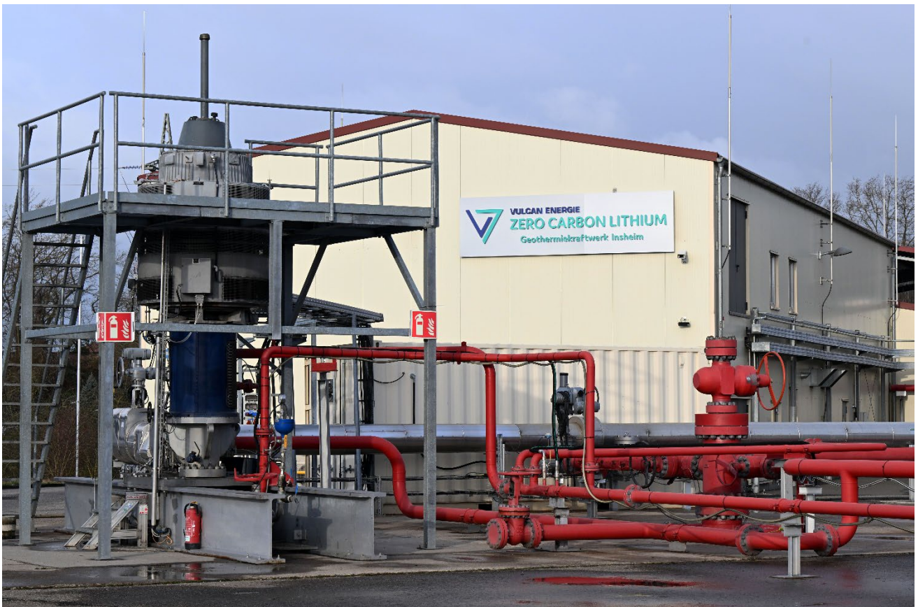
Figure 1: Natür 3 Lich Insheim - Vulcan's operating geothermal renewable energy plant

Vulcan's operating geothermal renewable energy plant, Natür 3 Lich Insheim generated €1.64 million revenue for the Quarter. During the period, the power plant fed approximately 6,350 MWh of renewable electricity into the grid, supplying 7,500 households with power, and avoiding CO 2 emissions, helping Germany to respond to the energy and climate crises in Europe.