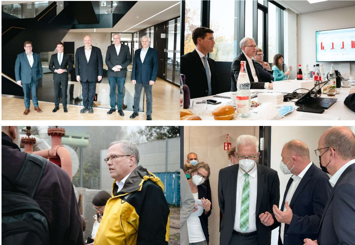
Figure 1: Recent visits to Vulcan's pilot and laboratory operations by representatives of the CDU Party, and by Winfried Kretschmann (Green Party), Minister-President of Baden-Württemberg, where they discussed the Vulcan Zero Carbon Lithium™ Project.