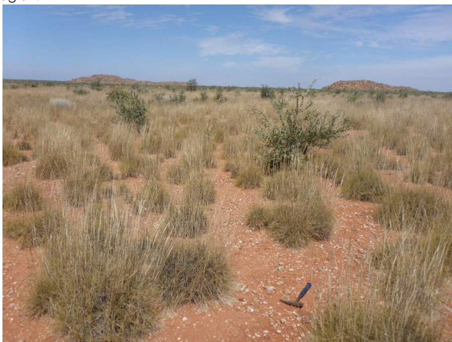
Figure 1 – Bolt Cutter Project in the Mallina Gold Province – Pilbara WA

The recent discovery of the Hemi gold deposits by De Grey Mining Ltd (ASX:DEG) has uncovered a major new gold system in the Mallina Gold Province. The Mallina Basin is a large and highly prospective gold province and the recent exploration success suggests that the Province is highly prospective. The exploration maturity of the Mallina Basin is lower than many other gold regions in WA, and recent exploration successes there may indicate that there is significant untested potential in the region.