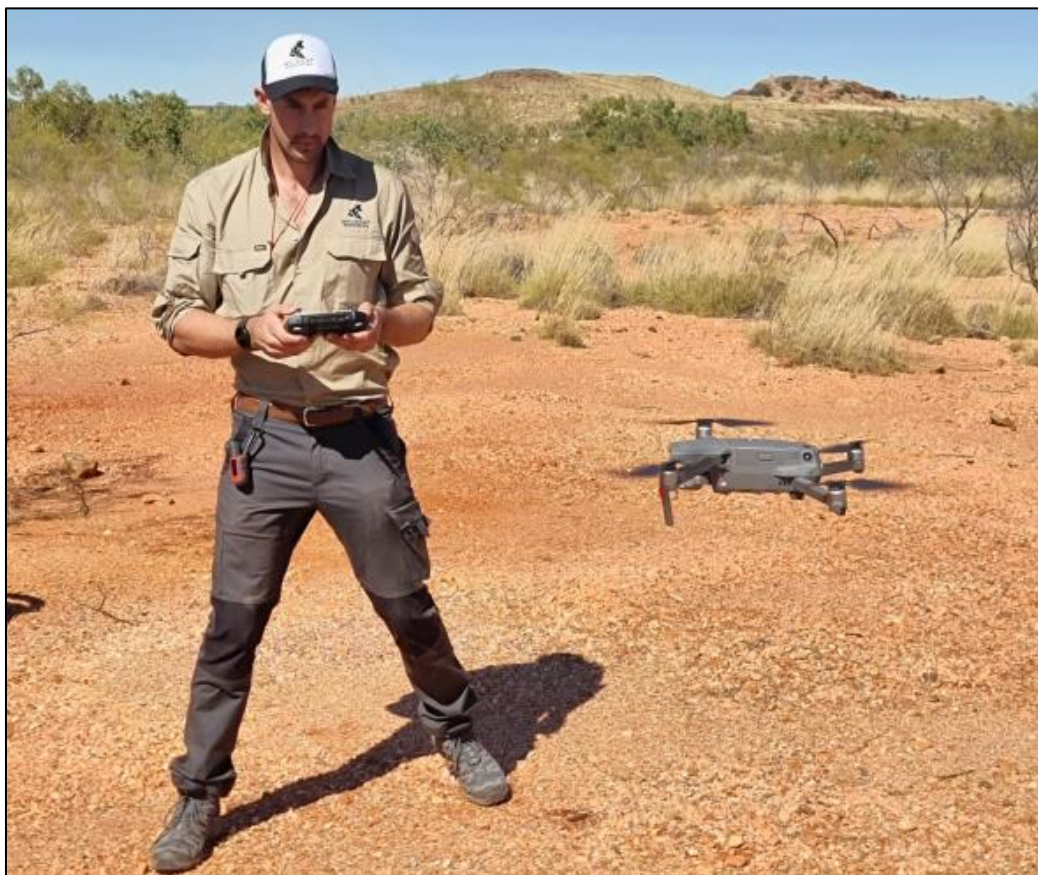
Figure 1 – The Company has commenced fieldwork at Tabba Tabba

The Company recently entered into an exclusive, binding, conditional agreement to acquire 100% of the Tabba Tabba Lithium-Tantalum Project 1 , which contains a group of granted mining leases , with large areas of outcropping pegmatites and a Mineral Resource estimate of 318Kt at 950ppm Ta 2 O 5 1 . Tabba Tabba was once one of four significant tantalum projects owned by Sons of Gwalia in the early 2000's, which included Greenbushes, Pilgangoora and Wodgina.