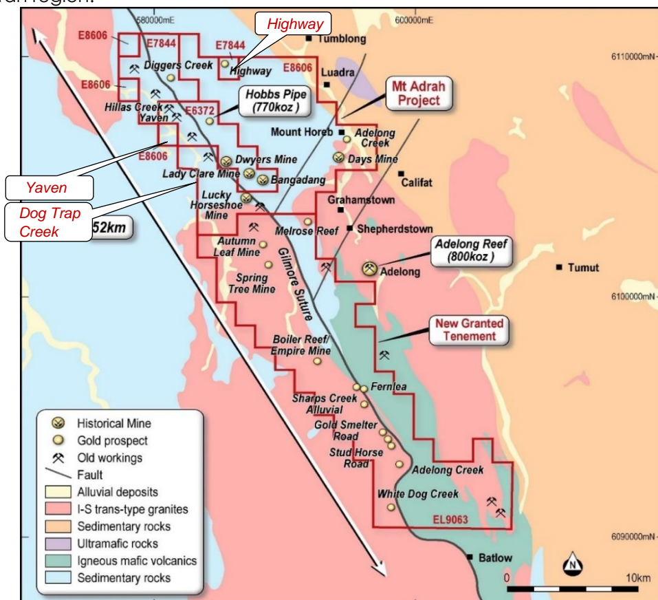
Figure 1 – New tenement granted at Mt Adrah expanding the strike along the prospective Gilmore Suture to 52km