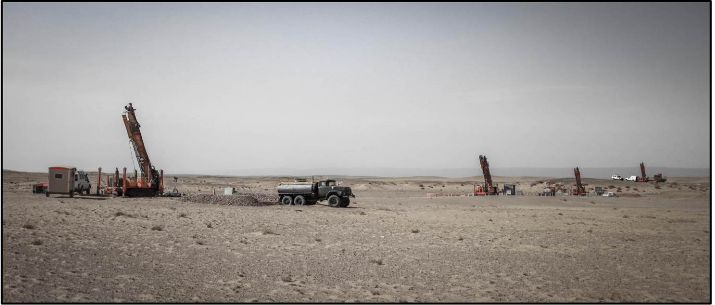
Figure 3: Four diamond drill rigs drilling at White Hill.